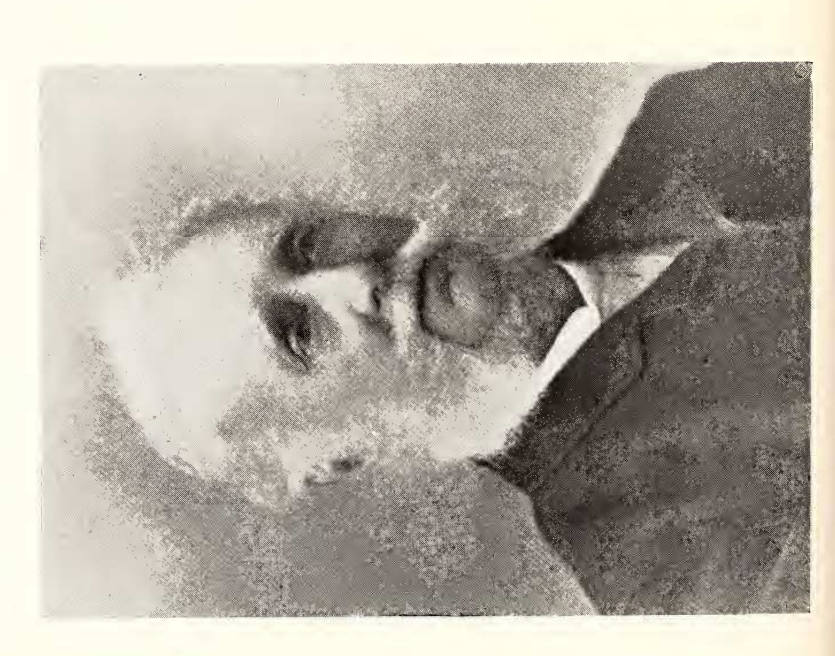
JOURN. BOMBAY NAT. HIST. SOC.